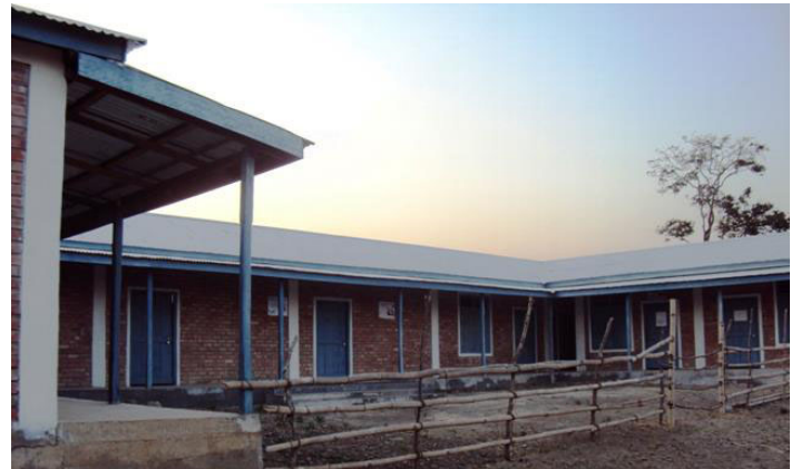
Suangdoh Govt. High School building thak luahlouh a om

Suangdoh Hausate' inn a ann nek zoh in Siamsinpawlpí Suangdoh Block President in amau Block dinmun putlaakna hon nei a, tua khit in mipi kikhophawmna mun ding lam manoh in kipai chiat hi.